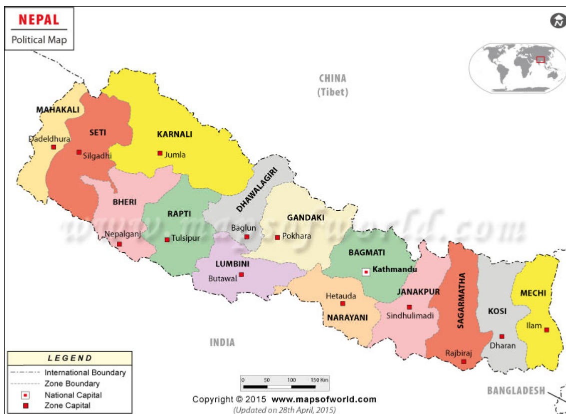
Figure 1: Nepal 23

Nepal is divided into 5 Development Regions, 14 zones as illustrated in Figure 1 and 75 districts.