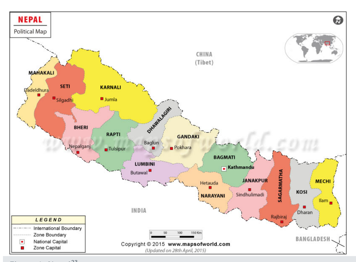
Figure 1: Nepal<sup>23</sup>

Nepal is divided into 5 Development Regions, 14 zones as illustrated in Figure 1 and 75 districts.